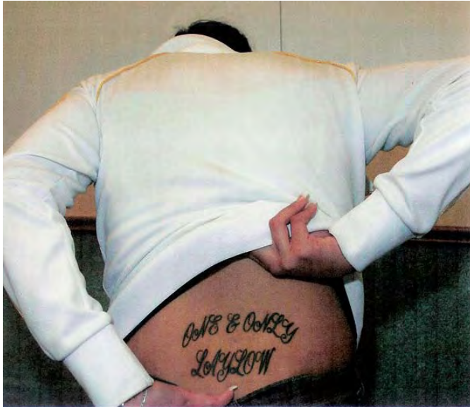
"One and Only Lay Low"